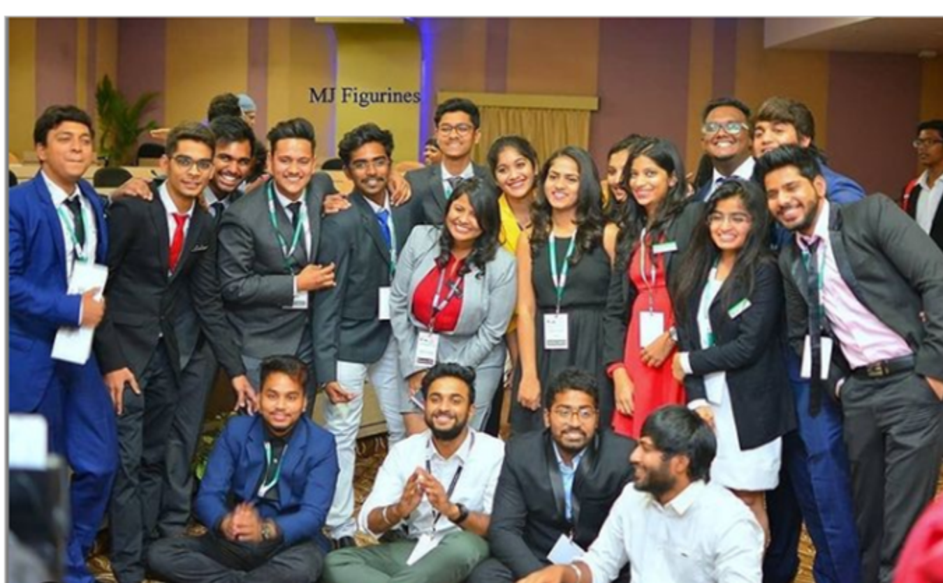
Team HYA 2017-2018