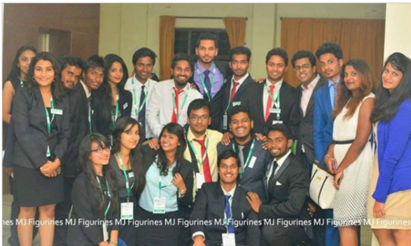
Team HYA 2015-2016