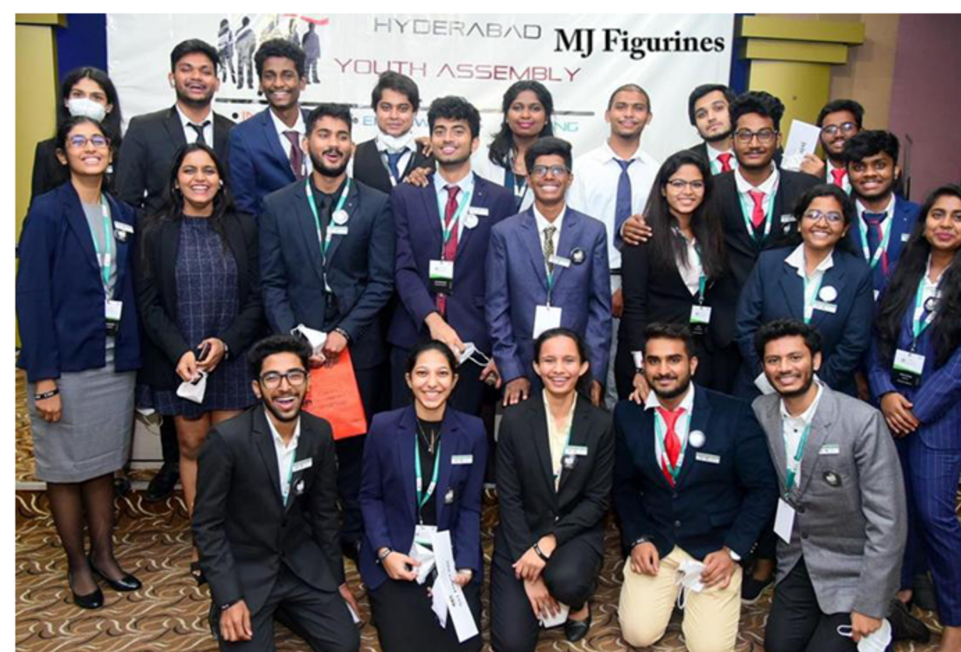
Team HYA 2020-2021