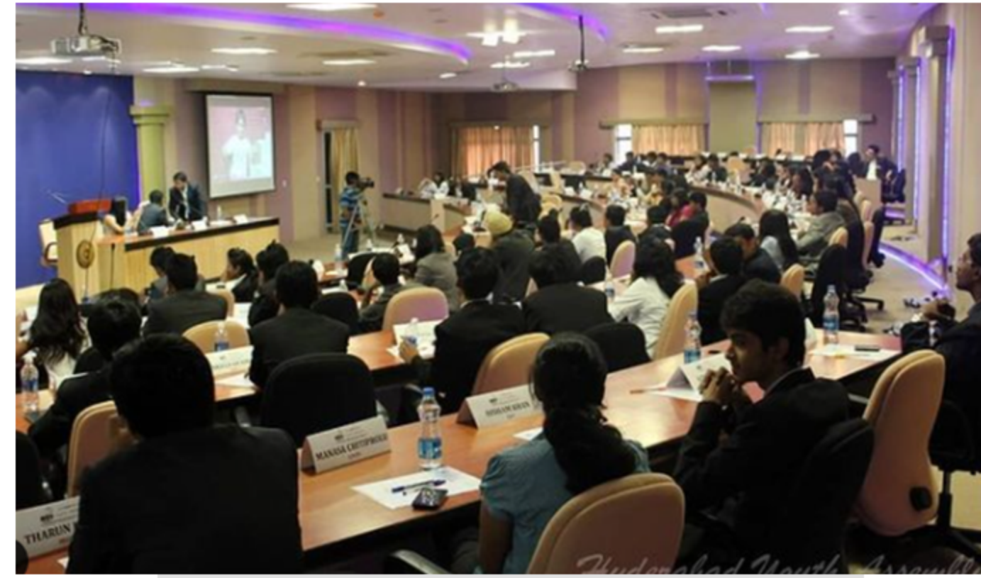
Team HYA 2012-2013