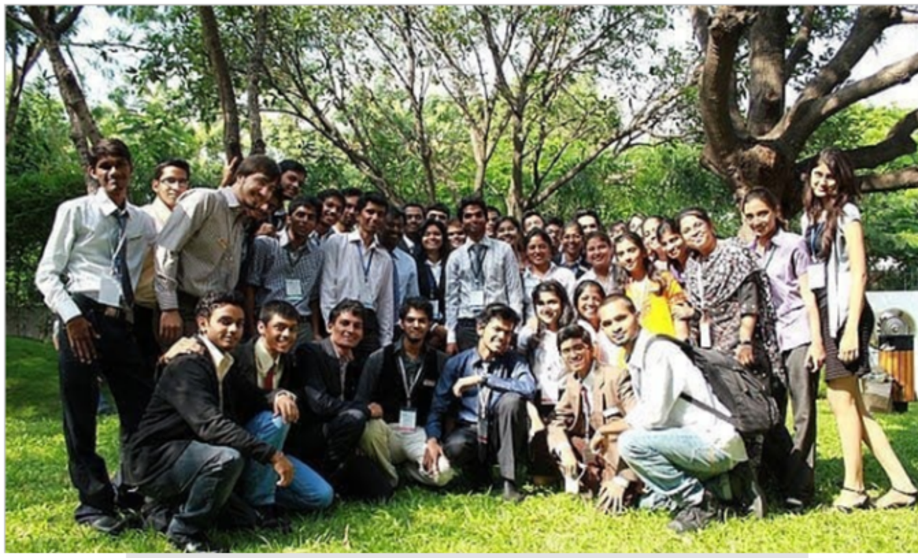
Team HYA 2011-2012