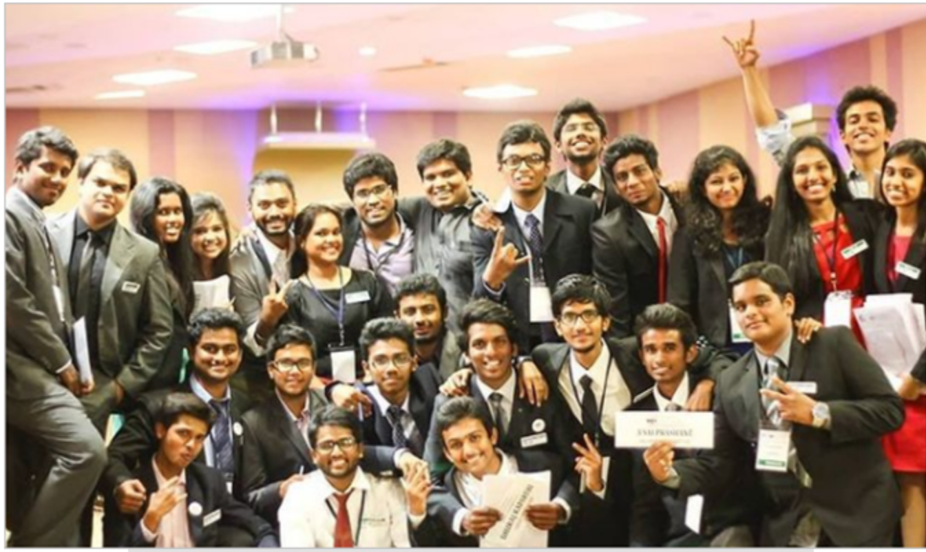
Team HYA 2013-2014