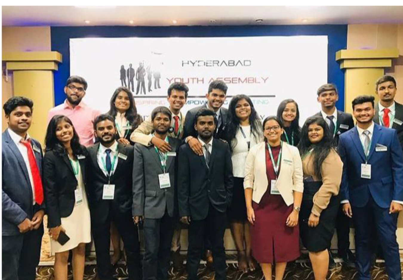
Team HYA 2019-2020