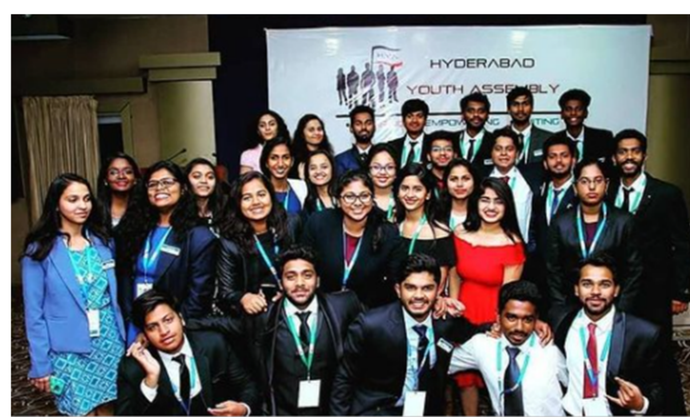
Team HYA 2018-2019