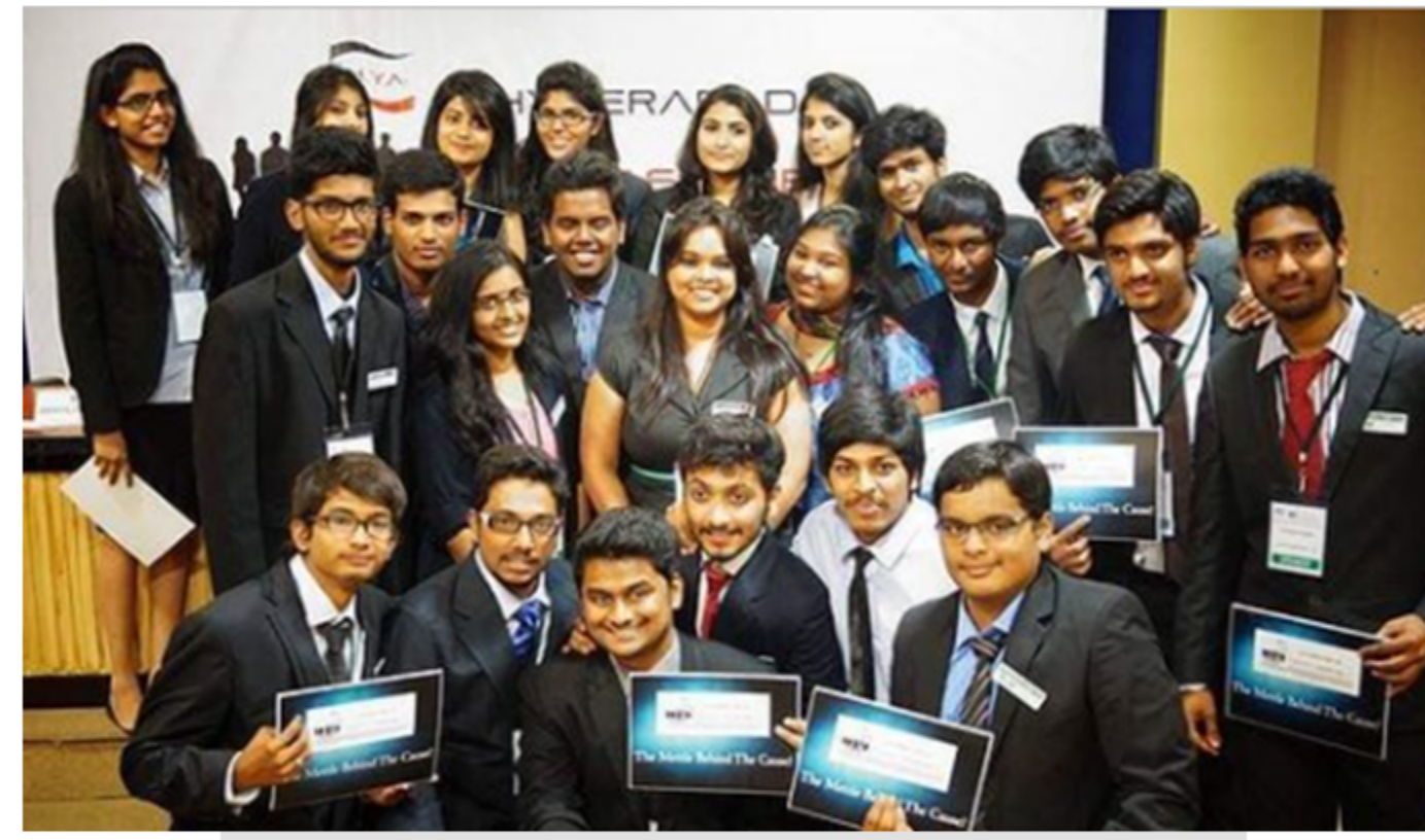
Team HYA 2014-2015