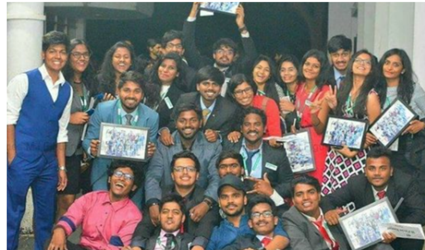
Team HYA 2016-2017